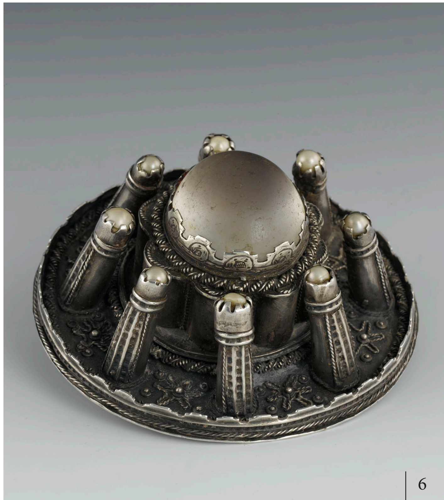
The Brooch of Lorn ( nms.ac.uk/explore-our-collections/stories/scottish-history-and-archaeology/the-brooch-of-lorn/ )

“My wife is of McDougall descent and we found this fascinating. There is a huge amount of history here and we spent 2 hours taking the castle tour, wandering through the house and then the gardens. The money they are collecting is helping fund the further restoration and getting the McDougall collection properly housed. Worthwhile and we highly recommend a visit.” MacDougall Clan Member